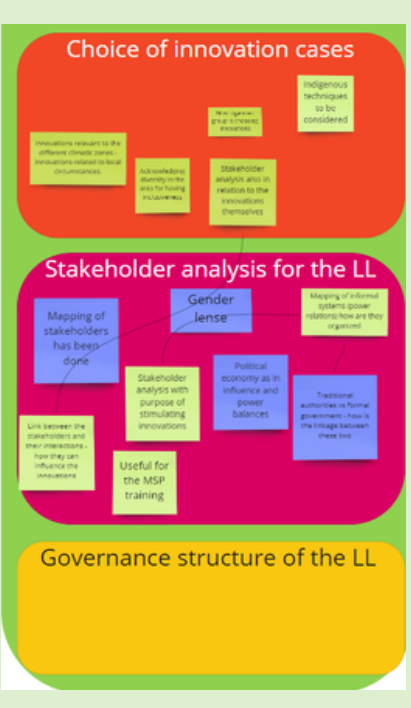
Miro board screenshot of the Round Table Dialogue on Living Labs - Situation Analysis - Zoom on Uganda