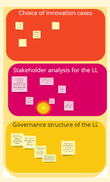
Miro board screenshot of the Round Table Dialogue on Living Labs - Situation Analysis - Zoom on Ehiopia