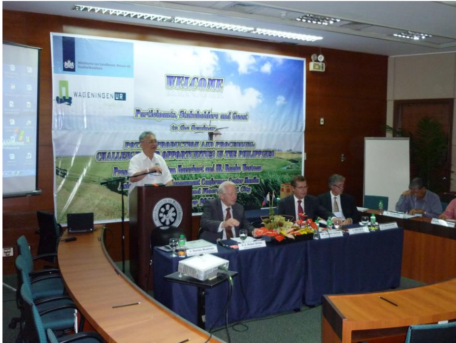
Potato seminar on October 6, 2009 in Manila

The 80 some delegates of the well attended seminar on Tuesday 6 October 2009 spanned the whole potato supply chain with farmers from Benguet, traders, wholesalers, representatives of the processing (Chips) industry, R&D and policymakers (assistant secretary of agriculture). The program is in appendix 5.