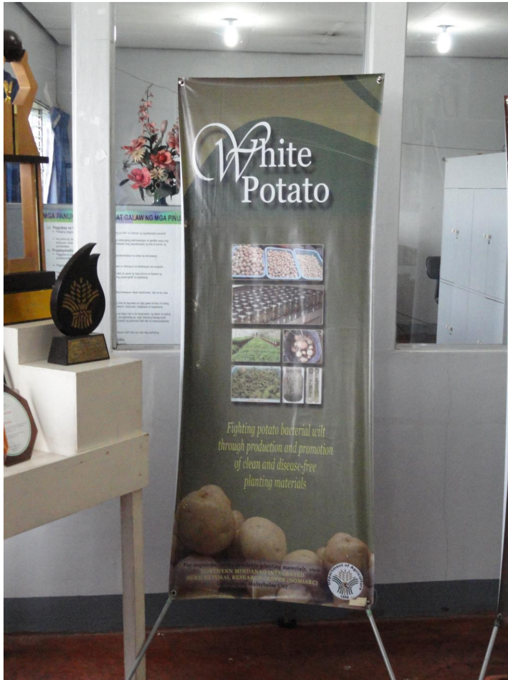
Poster at NOMIARC, Malaybalay (October 2010)

To manage BW in potato sustainably, the release of BW tolerant potato varieties should be combined with management techniques aiming to reduce the incidence of BW. NOMIARC is doing research into techniques for biofumigation of the soil and the use of appropriate crop rotations. Also protected agriculture (the production under plastic sheets) reduce BW incidence as it allows farmers to control soil moisture levels thereby reducing soil borne spread of BW. This work, along with the transfer of knowledge regarding the management of BW to farmers, should be continued.