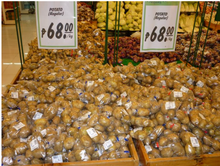
Plastic wrapped potatoes for sale in supermarket in Malaybalay (September 2009)

Some share of varieties with higher dry matter content are processed into chips (crisps) when supply from abroad is unavailable.