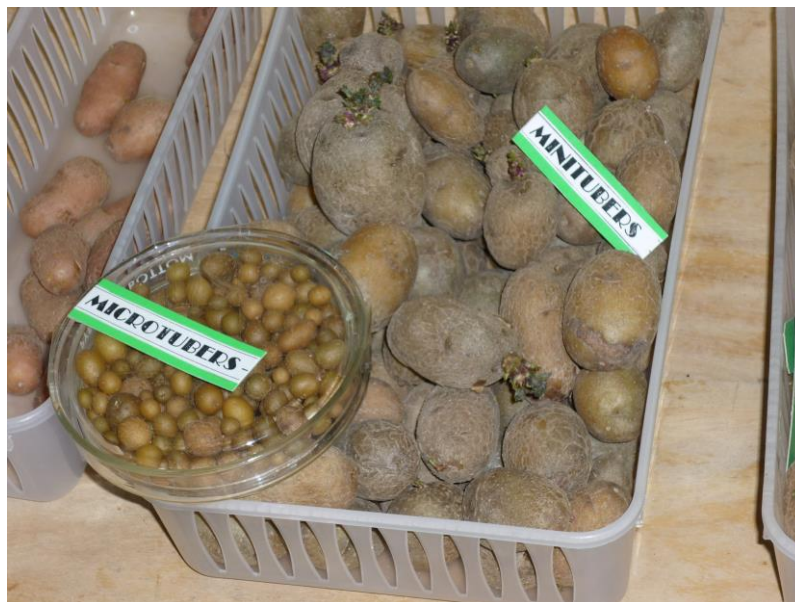
Micro tubers and minitubers at the Baguio research station (October 2009)

There are introduction schemes of basic seed material. The Bureau of Plant Industry (part of the department of Agriculture, DA) in Baguio has a rapid multiplication laboratory from which they sell stem cuttings (1 Php each) to interested farmers who grow minitubers from them for own and neighboring farms. Part also goes to the (36 ha) BPI seed farm in Northern Luzon. At Mindanao, NOMIARC (also part of the DA) has rapid multiplication facilities from which they sell minitubers at 2.5 Php each. Some 11 special growers were trained to produce 'certified' seed but the added value was such that after a number of years the interest to be a 'specialist seed grower' disappeared. The facilities are adequate. Demand from farmers, however, is limited. That may be due to insufficient demonstration of improved seed's superiority or the improvement over traditional seed is marginal. All fields visited showed remarkably low incidences of viruses.