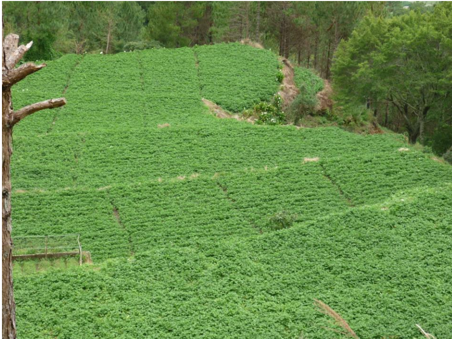
Potato fields in the Luzon highlands north of Bagio (October 2009)

All practices are carried out by hand and no part of production is mechanized. Table 1 summarizes the differences in crop characteristics of the Cordillera Autonomous Region (CAR) and Mindanao.