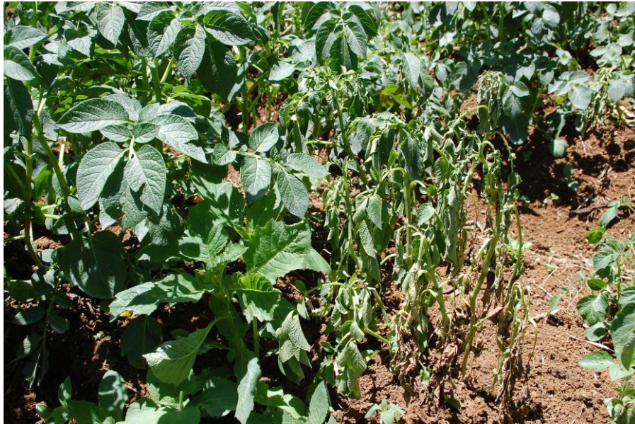
Bacterial wilt affected potato plant in the Bukidnon highlands (April 2010)

The Cordillera Autonomous Region (CAR) has the longest potato growing history in Philippines. Potatoes are grown in a narrow rotation. Many fields are infested with bacterial wilt ( Ralstonia solanacearum ) and with Globodera nematodes. Late blight ( Phytophthora infestans ) is the prevailing fungal disease.