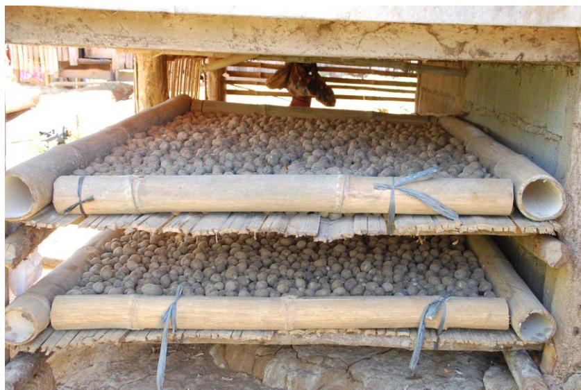
Diffused light store for seed potatoes in the Luzon highlands (October 2009)

The most commonly grown table potato variety is Granola, others reportedly are Conchita, Cosima, Red Pontiac, Solibao (BSU PO3), Franze and Asterix. The most widely appreciated variety is Granola. Latest seed potato imports of Granola date back to 1983. The degeneration rate of Granola is very low. Igrotta is a variety bred by the Benguet State University, it has a high dry matter content rendering it suitable for processing. The variety has been placed on the National list. Igaroto is a recently released variety developed by the potato breeding program of Benguet State University. The variety has a high dry matter content and is suitable for processing.