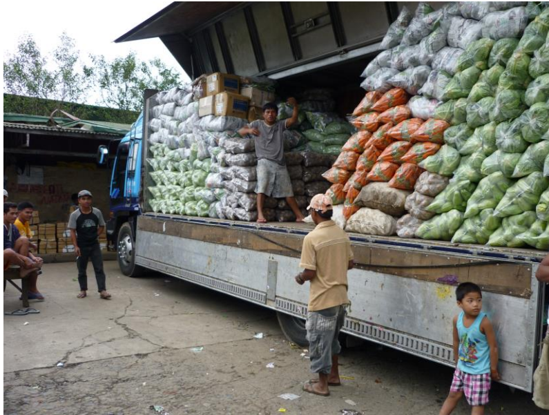
Transporting potatoes and vegetables from Bagio to Manila (October 2009)