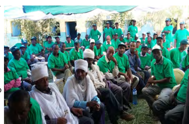
Launch event in Abrehajira woreda

product value addition activities and providing production and marketing credit and warehouse rental services to their members.