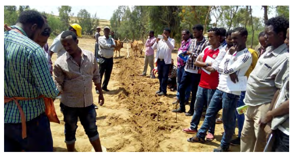
Participants on practical training session

The training had both practical and theoretical components. The theoretical part comprises contents on agronomy, pest and disease management and postharvest handling techniques. After the training, discussions were held on model farmers' experiences applying the '20 Steps' improved sesame production package. During discussions, woreda and zone experts raised major challenges faced in the previous production seasons towards further scaling the '20 Steps', including shortage of rainfall, absence of suitable row planters, limited support from development agents, and incomplete application of the '20 Steps'. They discussed on how to solve these challenges. The discussion on