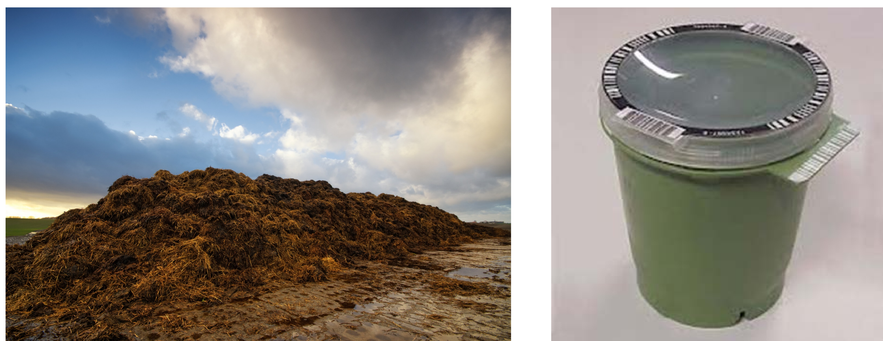
Figure 1. A heap of manure (left) and a typical sample container (right).

From a heap or transport of manure a sample is taken (Figure 1).