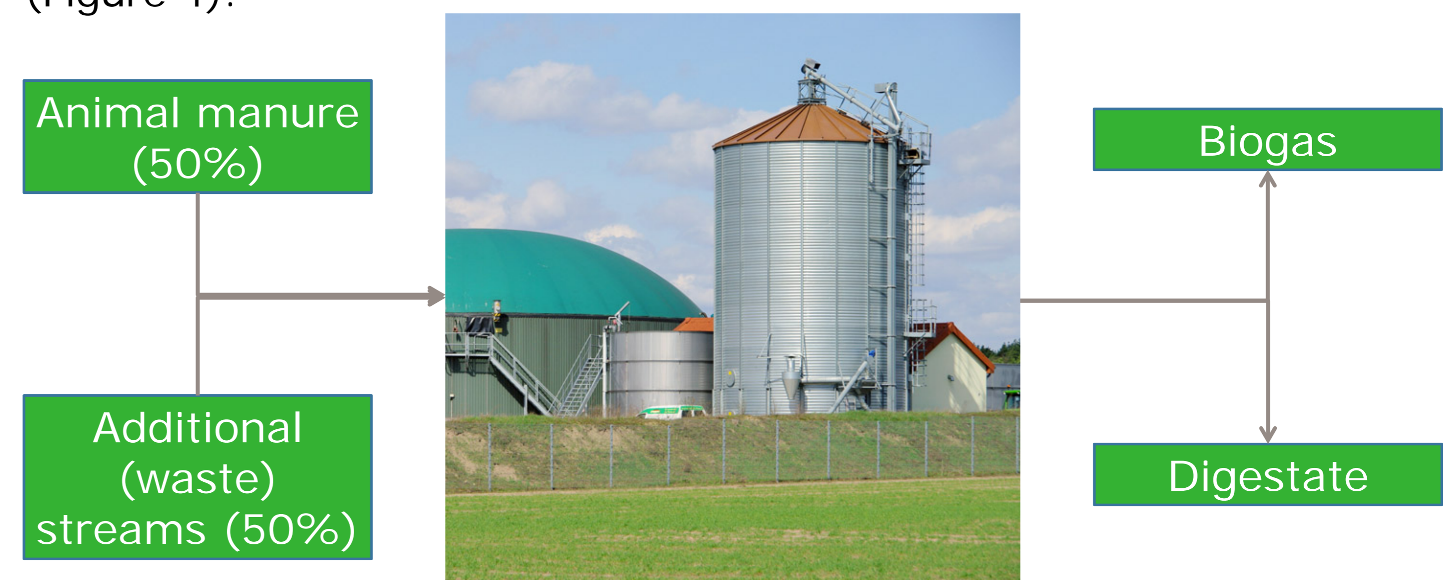
Figure 4. Biogas production from manure and waste streams.

Biogas can be produced from animal manure and other waste streams (Figure 4).